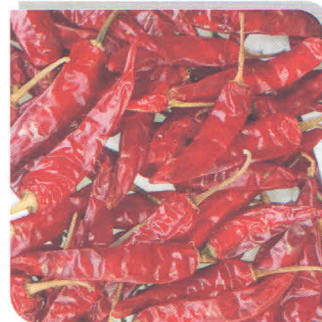
Endo 5 With Stem