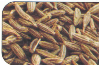
Cumin Seed Singapore Quality