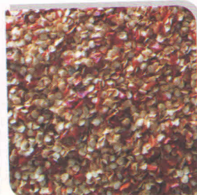
Teja Chilli Seeds