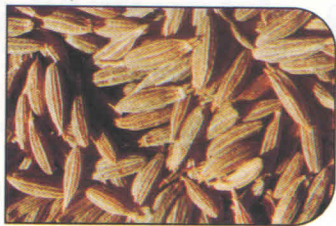
Cumin Seed EU Bold Quality