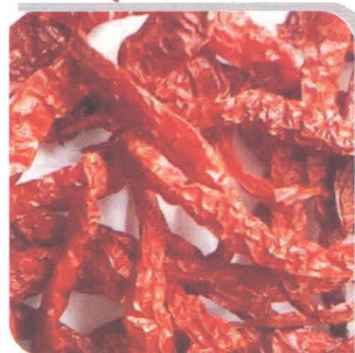
Byadgi Without Stem