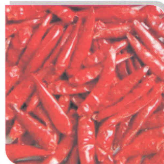
Endo 5 Without Stem