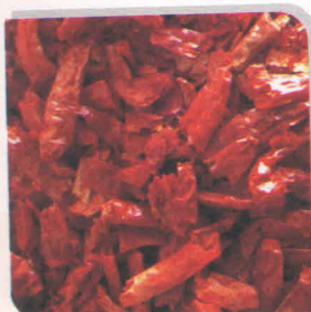
Teja Seedless Cut Chilli