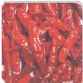
334/ S4 Sanam without stem