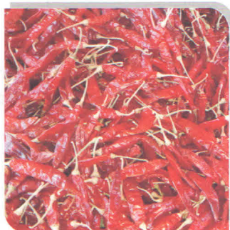
334/ S4 Sanam With Stem