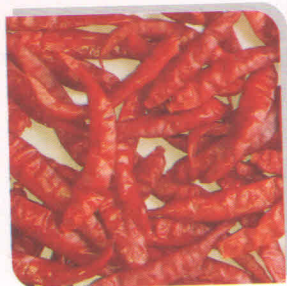
Teja(S17) Stem less