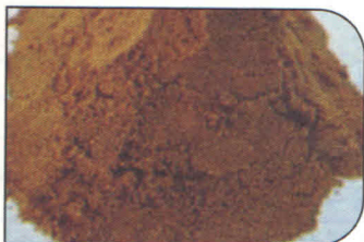
Cumin Seed Powder