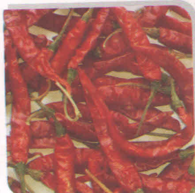
Teja(S17) With Stem