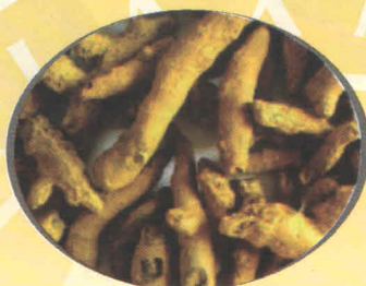
Alleppey Finger' (Kerala)