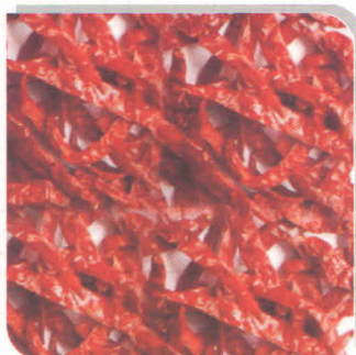
273 Wrinkle Without Stem