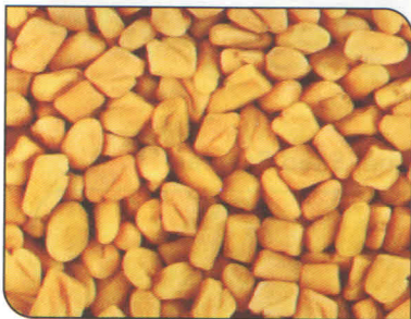
Fenugreek Seed Bold