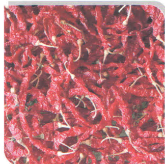
Byadgi With Stem