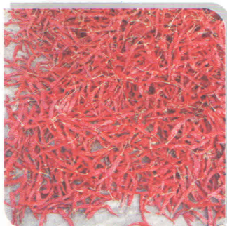
273 Wrinkle With Stem